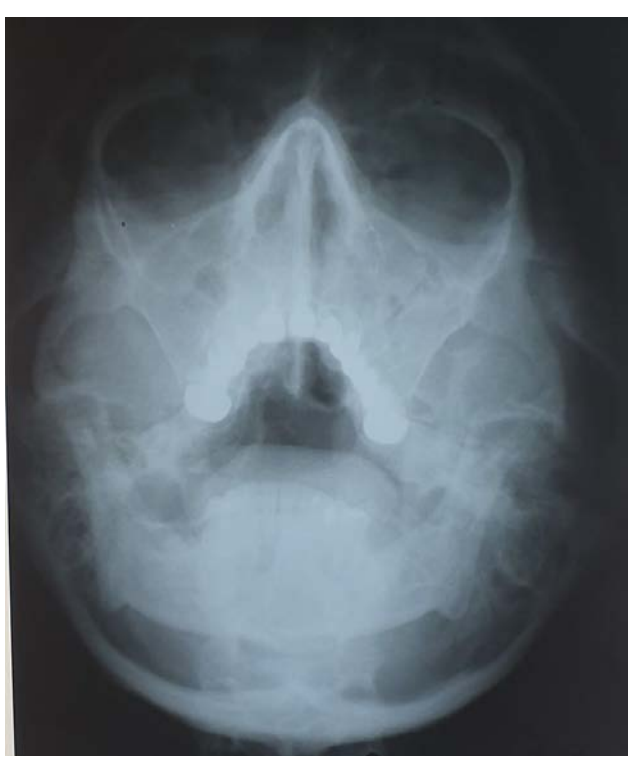
Fig. 3 – Radiological examination revealed bilateral maxillary sinusitis.

Radiological examination revealed bilateral maxillary sinusitis (Figure 3). The electromyoneurographic examination was performed and neuropathy was excluded. Peripheral blood smear and bone marrow biopsy ruled out a hematological disorder. Chest radiography and heart ultrasonography were normal. However, microscopic examination of bronchoalveolar lavage confirmed eosinophilia (63%). Histopathologic findings of bronchoscopic biopsy revealed fragments with abundant eosinophilic and lymphocytic infiltrates as well as the foci of eosinophilic microabscesses. Pericapillary eosinophilic infiltrates affecting the lung interstitial were observed with transbronchial biopsy which could be a histologic sign of vasculitis.