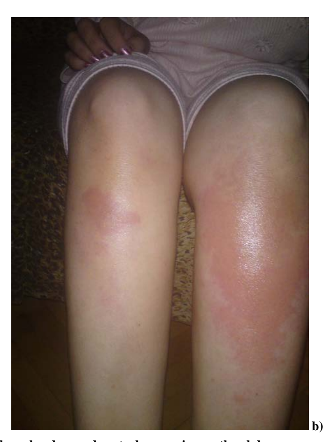
Fig. 1-a) Widespread erythematous plaques with sharp borders and central regression on the abdomen; b) Urticarial plaques on the lower extremities, clinically resembling cellulitis.

Histopathologic examination of the skin lesions demonstrated abundant lymphocytic and eosinophilic infiltrates in the dermis, with characteristic eosinophilic staining in the form of "flame figures", which was consistent with the diagnosis of WS (Figure 2). Direct immunofluorescence microscopy did not reveal any deposits of immunoglobulin or complement in the skin biopsy.